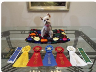
Fate with her Titles